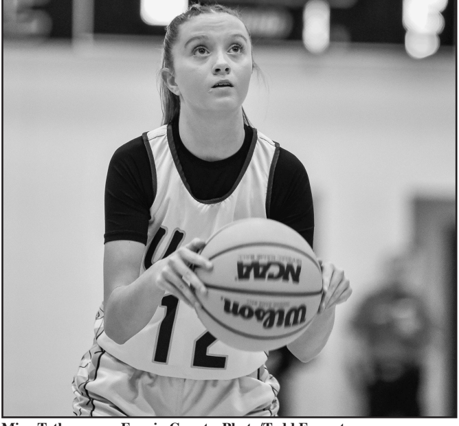
Miya Totherow vs. Fannin County.