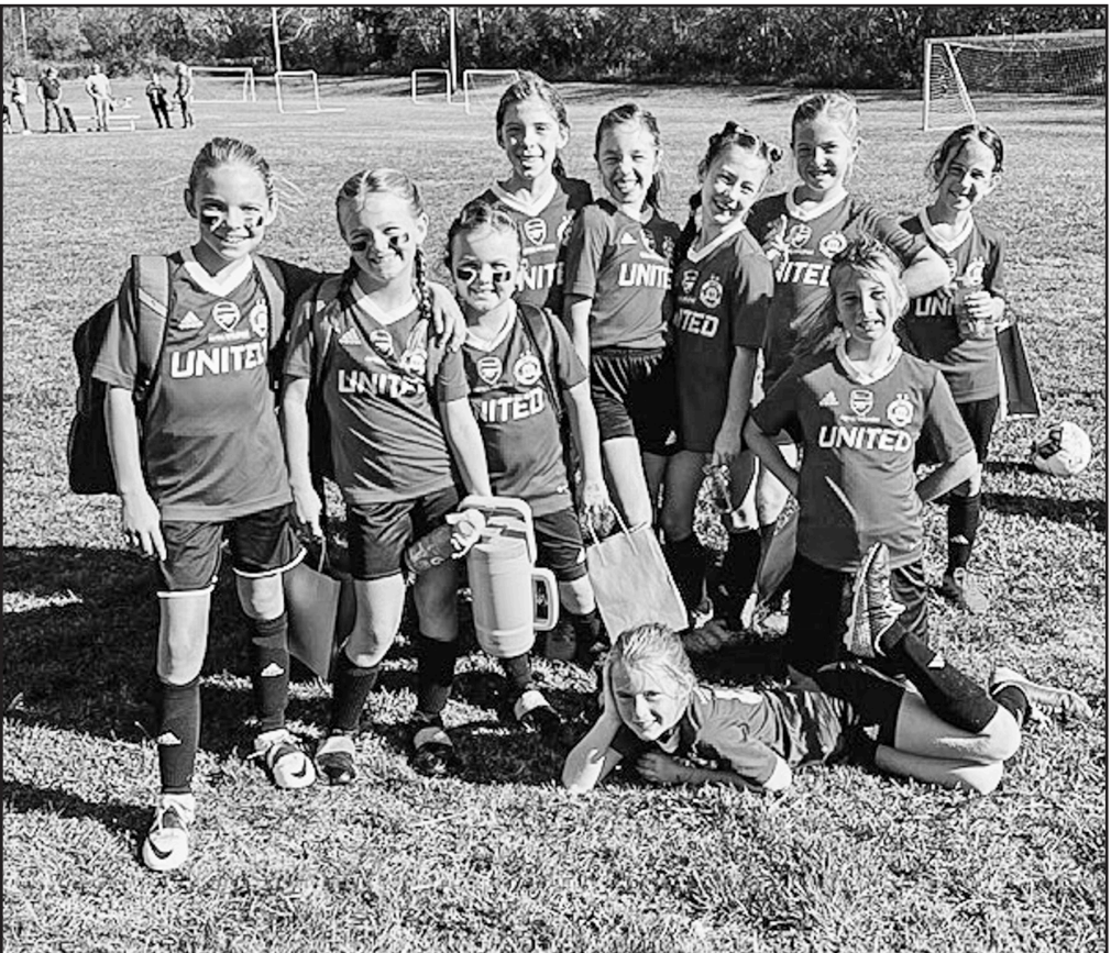
The Union County 10U girls soccer team finished the year undefeated. The girls had 73 goals, 33 assists, 19 saves and only 5 goals scored on them. Every player had more than one goal. And we had 6 shut-outs! The Gunners worked hard together and NEVER stopped wanting to learn and develop more skills! We feel blessed to have represented Union and look forward to next season.