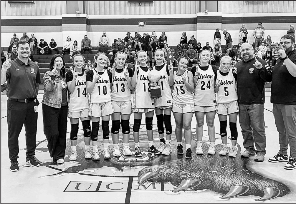
Union County's 8th grade girls collected more hardware on Wednesday, Dec. 18.